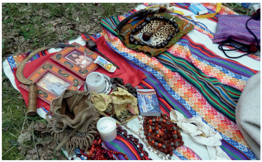
Figure 4: Line Sturny's altar, Bugarach, July 2013

ing a healing ritual. In this case, the brooms were short and held in one hand. While some had a wooden handle, others were simply branches tied together.