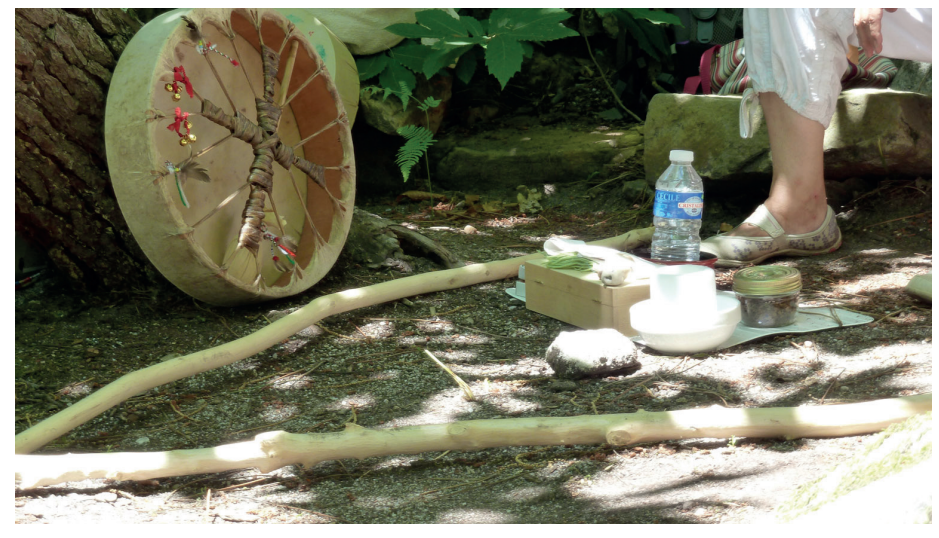
Figure 5: Drum and medicine stick, Bugarach, July 2013

a dried and hollowed fruit or vegetable, a shell, a sewn leather case filled with seeds, beads or minerals. Afterwards, it is decorated with leather straps, ribbons, feathers, beads and drawings. The rattle may, of course, be used to play music,