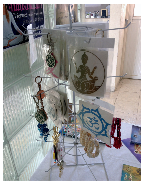
Figure 2: Key rings featuring the world religions, April 2014, © M. Farahmand