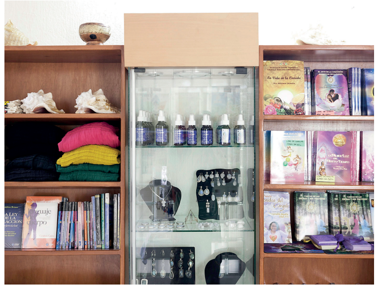
Figure 1: Esoteric shop at Casa del Sol, April 2014, © O. Gschwend

with the shamans Har Sono and Tenger Huu . Inspired by the ascetic Sri Verabramindra Swami , the master Balayogi<sup>32</sup> and the mythology of Ram<sup>33</sup>, Dacquay has travelled to India on many occasions for spiritual retreats. The country has influenced his workshops and training sessions on tantrism. This hybridization between Indian and Celtic influences follows its own natural logic since Dacquay defends the idea that the druids were similar in function and in social position to the Brahmin Indians.