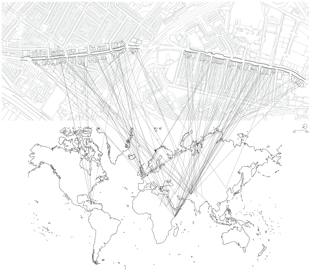
Figure 1: World to Street: A survey of proprietors on Stapleton Road by country of birth (2015).

(Barry, 2013). The migrant groups that occupy this street come from different parts of the world, and are emplaced in Bristol and on Stapleton Road, through a plethora of urban sorting mechanisms that rank racialized and ethnicized bodies relative to place.