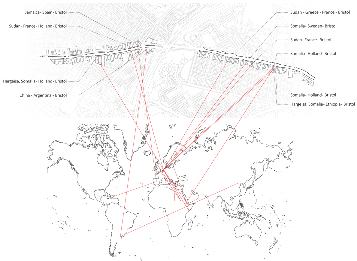
Figure 2: Multiple Journeys: A survey of proprietors on Stapleton Road and their multiple migratory routes (2015).

neys of proprietors before they reach Stapleton Road. Here, we drew lines from city to city and finally to the street, revealing the complex routes undertaken by respective proprietors. Not all proprietors articulated their extended journeys to us, but of those who did, a compelling narrative emerged of the kinds of energy and agility required in becoming multiple migrants. Their contorted journeys are captured in red zig-zag lines that cover vast distances: China-Argentina-Britain; Jamaica-Spain-Britain; Sudan-France-Holland-Britain. Following the trace of these lines, we see migration trajectories that include examples of 'twice migrants' as those who migrated to one other country before arriving in Bristol, as well as the emergence of 'thrice migrants' as those who migrated to two other countries before settling in Bristol. The image encapsulates the complex and arduous journeys and multiple relocations undertaken by proprietors on Stapleton Road. It refutes the notion of a linear migrant movement from one place to