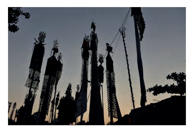
Figure 9: The procession of Ashura afternoon in the south of Mumbai, December 2009

Shi'a Ithna-Asharis, in groups known as anju mans , participate in the procession of Ashura day from all over the city, including Shi'as from UP who come from Mumbra or Govandi. While these anjumans carry their ta'zyehs through local processions, they participate in the main procession in Dongri without the ta'zyehs . In other words, in local processions they signal their UP identity, but when it is time for the main procession they simply follow the Mumbai format of the procession. Indeed, while the Shi'as from UP keep practising their own custom and identity at the local level, they exercise and exhibit their solidarity with other Shi'a communities during the major event.