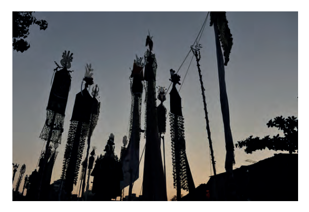
Figure 9: The procession of Ashura afternoon in the south of Mumbai, December 2009

Shi'a Ithna-Asharis, in groups known as anju mans , participate in the procession of Ashura day from all over the city, including Shi'as from UP who come from Mumbra or Govandi. While these anjumans carry their ta'zyehs through local processions, they participate in the main procession in Dongri without the ta'zyehs . In other words, in local processions they signal their UP identity, but when it is time for the main procession they simply follow the Mumbai format of the procession. Indeed, while the Shi'as from UP keep practising their own custom and identity at the local level, they exercise and exhibit their solidarity with other Shi'a communities during the major event.