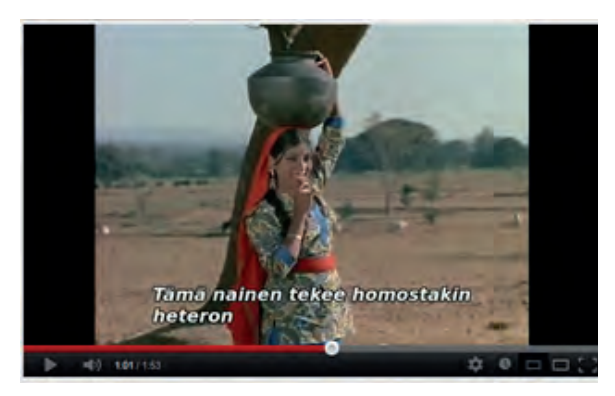
'This woman will turn even a queer into a straight guy'

Another scene of the buffalaxed video which also subverts the heterosexuality of the two men apparent in the original film features a brief encounter with a young woman. The original scene has no dialogue or lyrics, but the buffalaxed video has added subtitles which assign new meanings to the encounter (e.g. 'the sexual orientation of the two Teros is put to the test / This woman will turn even a queer into a straight guy'). Like the practice we know from silent films, the subtitles thus function as narrative commentary steering the interpretation of what we are seeing in the scene in a particular direction.