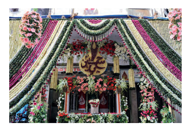
Figure 1: A Bohras' sabil , Dongri, Mumbai, December 2009.

The first thing that anyone would notice on a short walk around Dongri during Muharram is the transition from the Ithna-Asharis' territory into the Bohras'. The Ithna-Asharis' sabils are mainly covered with black textiles, as black is simply the colour of grief. However, the Bohras' sabils are very colourful and completely covered with flowers. This display signals the Hindu background of the Bohras and can also be perceived as a symbolic way of glorifying the status of the Karbala martyrs.