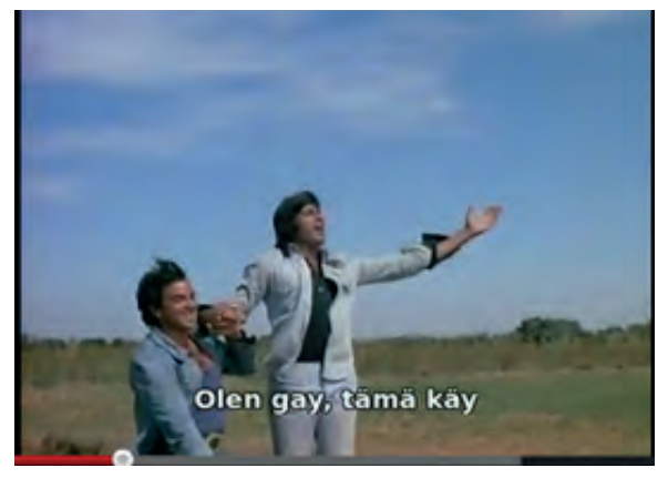
'I'm gay, this is OK'

More specifically, the lyrics drive home this interpretation by their sexually explicit lexical choices. For example, the two men are depicted as having 'fucked' and being 'gay'. In addition, the refrain, "Tero saatana, s'olet gay" ('Damn, Tero, you're gay'), amplified by jocular and emphatic swearing, energetic singing and expansive body language, reinforces the impression that these two men are indeed celebrating their homosexuality here.