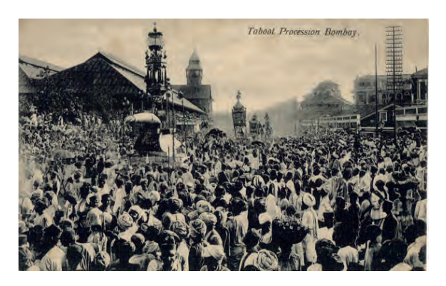
Figure 7: Taboot Procession, Bombay, late nineteenth or early twentieth century.

the ta'zyeh was no longer associated with the processions. Moreover, when the main Mumbai procession in Dongri was established during the late 1960s and early 1970s, it was towards the Rahmatabad cemetery in Mazgan and not a seafront (figure 6). Therefore, unlike other Indian cities, the ta'zyehs are not carried throughout the main processions in Mumbai. This description is about the ritual in Dongri, known as the heart of Mumbai's Muharram rituals. However, in some areas like Mumbra or Govandi, the ta'zyehs are built and carried in local processions, identifying the Hidustani Shi'a communities that are mainly from UP. It is difficult to define the Hindustani Shi'as in Mumbai, however, Hindustani Shi'as are those who are not Khojas, Bohras, or Iranians. This group is mainly from UP and is not as financially well-established as the other three communities. However, it is also rather difficult to simply limit the idea of Hindustani Shi'as to being lower-class Shi'as.