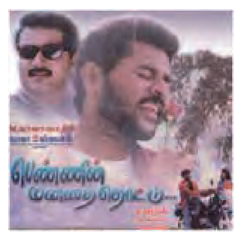
An advertisment for Pennin Manadhai Thottu

Benny Lava (http://www.youtube.com/watch?v = uYwS9k1ZexY) is a resemiotization of a song and dance number from a South Indian Tamil motion picture Pennin Manadhai Thottu (2000). The film depicts a romance between a famous heart surgeon Sunil (Prabhu Deva) and Sunitha (Jeya Seel) who seeks his help for a child with a heart problem. Eventually it turns out that the two had been in love in college but that the man had deserted her at a crucial time. This misunderstanding is finally overcome and the two protagonists are united again.