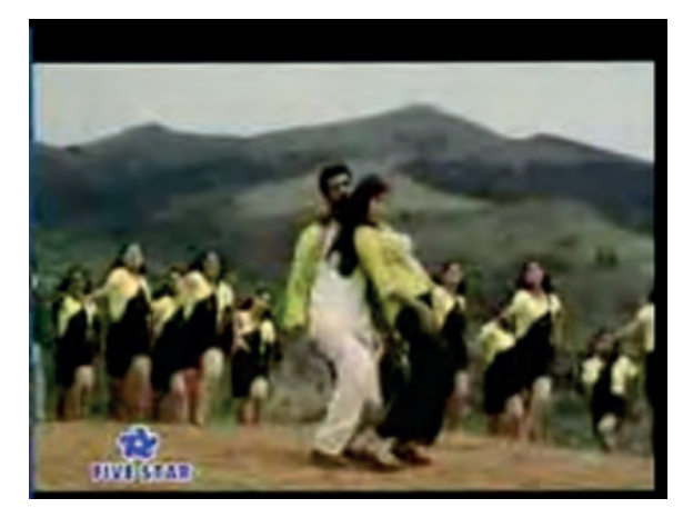
The leading couple with their entourage

The original video depicts a song and dance scene with a large group of young women and men on a green mountain slope. The song and dance number represents the flirtation and wooing going on between the two main characters. The lyrics of the Tamil song Kalluri Vaanil in the original film, their English translation, and the buffalaxed subtitles can be accessed at http:// www.youtube.com/watch?v=wyp7D2Nzib0.