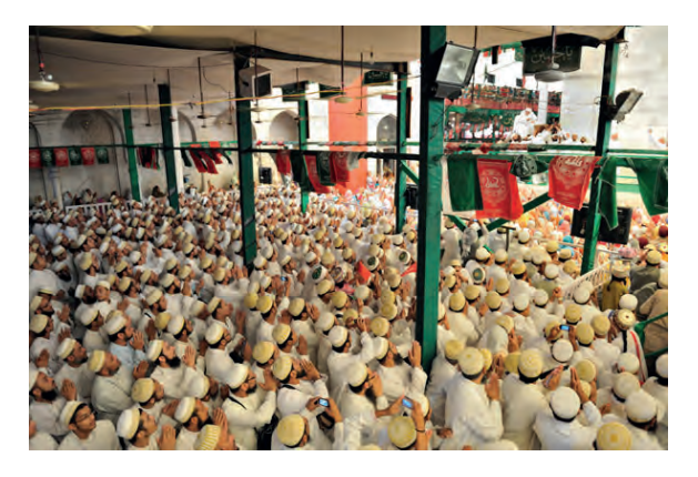
Figure 2: It was an emotional time for Bohras at Rowdt al-Tahera when their spiritual head, Sayyedna Mohammed Burhanuddin, passed by after the majlis , Mumbai December 2010.