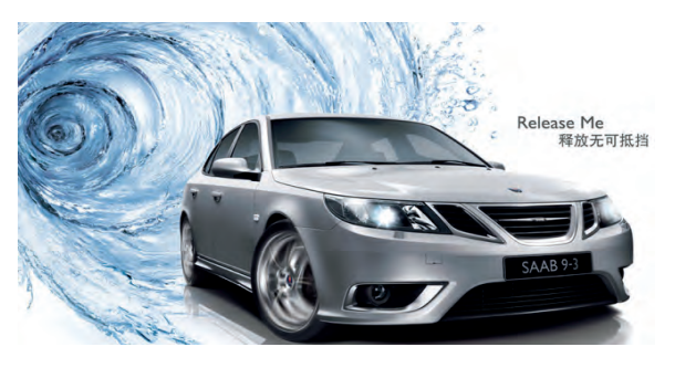
Figure 3: Saab car ad: Release me

Therefore 'mensao' is a particular kind of 'coolness' they constructed, and that they modeled on the coolness they saw in Saab cars. Interviewee A describes their kind of 'coolness' in turn 8 and says that 'Saab is like that', and he repeats this point in turn 10 'there is another side (of Saab), but (both Saab and us) don't like showing off'. 'Mensao' therefore is not only the shared characteristic of the group members but also that of the Saab car. Interestingly, a Saab commercial constructed a similar image (Figure 3).