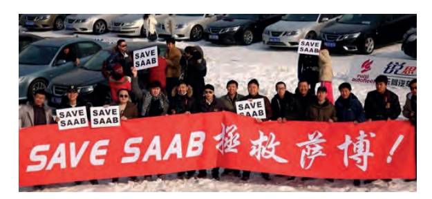
Figure 2: 'SAVE SAAB' gathering

Another example of trying to have their voice heard globally through English is the group members' recent efforts in 'Save Saab' from bankruptcy. When Saab filed for bankruptcy, the Chinese Saab owners displayed tremendous brand loyalty and publicly pledged to save Saab (Figure 2).